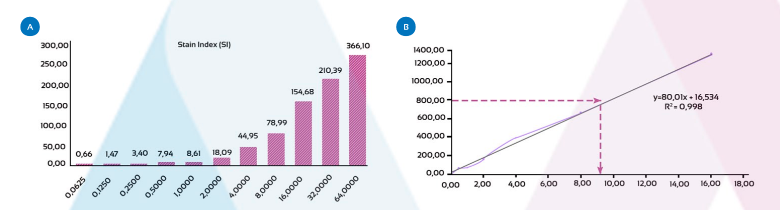
Figure 3: Sensitivity and linearity analysis. A Flow cytometry analysis of sensitivity (Stain Index) of different quantities (0,0625 to 64 μg) of exosomes relative to the negative control (0 μg). B Correlation between exosome quantity and CD9 MFI. Exosome quantity was plotted against MFI, resulting in a linear correlation between 0 -16 µg. R2=0,99. Exosomes isolated from cell culture supernatant of the human prostate cancer cell line PC3 were used.