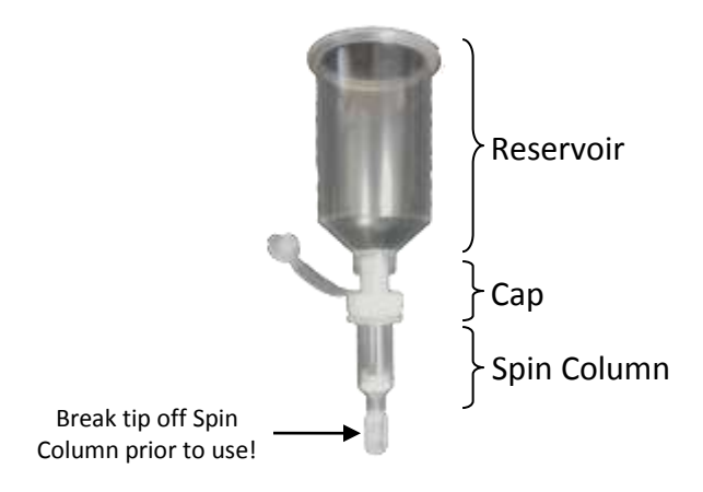
Figure 1: Midi•SAL™ Spin Column Assembly.

In the Oasis Diagnostics® Midi•SAL™ purification procedure, DNA is isolated and purified using the Midi•SAL™ Spin Column Assembly (Figure 1) which contains an attachable high volume reservoir for sample loading. The Midi•SAL™ purification procedure comprises 4 main steps (Figure 2), Digest, Bind, Wash & Elute. The procedure is carried out using a large volume capacity centrifuge with a swinging bucket rotor and a microcentrifuge.